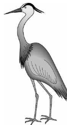
specialized body parts